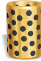
1272 - d_1 \times L_1